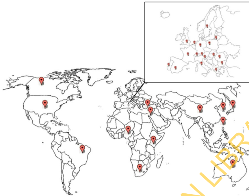
FIGURE 1 Psycho-oncology societies, currently (2015) members of the International Psycho-oncology Society (IPOS) Federation, by areas of the world: Africa: Psycho-oncology Society of Nigeria (POSON); North America: American Psychosocial Oncology Society (APOS), Canadian Association of Psychosocial Oncology (CAPO). South America: Brazilian Psycho-oncology Society (SBPO). Europe: Austrian Platform of Psycho-oncology (ÖPPO), British Psychosocial Oncology Society (BPOS), Bulgarian Society of Psycho-oncology (BAPO)*, Dutch Society of Psychosocial Oncology (NVPO), French Society of Psycho-oncology (SFPO), German Association of Psycho-social Oncology (DAPO), Hellenic Society of Psychosocial Oncology (HSPO, Greece), Hungarian Psycho-oncology Society (MPOT); Italian Society of Psycho-oncology (SIPO), Lithuania Association of Psychosocial Oncology (POA, Lithuania), Polish Psycho-oncology Society (PPOS), Portuguese Academy of Psycho-oncology (APPO), Portuguese Psycho-oncology Society (SPPO), Romanian Association of Psycho-oncology (ARPO), Slovenian Society of Psycho-oncology; Spanish Psycho-oncology Society (SEPO), Swedish Psycho-oncology Society (SWEDPOS), Swiss Society of Psycho-oncology (SGPO). East Asia: Chinese Psycho-oncology Society (CPOS), Japan Psycho-oncology Society (JPOS), Korean Society Psycho-oncology, Taiwanese Psycho-oncology Society (TPOS). Australia/New Zealand: Australian Psychosocial Oncology Society (OZPOS) and Psycho-oncology Co-operative Research Group (PoCoG, Australia), Psycho-social Oncology New Zealand (PONZ). Middle East: Israel Psycho-oncology Society (IPSO); Turkish Psychosocial Oncology Association (PSOD). *The Bulgarian Society of Psycho-oncology became part of the Federation in 2015. There are also countries that have societies in a developing phase, including the Irish Society of Psycho-oncology, the Russian Society of Psycho-oncology, the Psycho-oncology Society in Kenya and the Society of Psycho-oncology in South Africa, where, at the moment, the South African Oncology Social Work Association (SAOSWA)

emerge in this study. Because the main aim of the questionnaire was to assess the profile of each society, the criteria for the developmental level of palliative care service from the Global Atlas of Palliative Care 20 were adopted by replacing the word palliative care by PSOC. The major areas covered by the questionnaire are reported in Appendix A, in which 6 levels of psychosocial care organization is indicated, as reached on a consensus basis within the aforementioned FPOS meeting. The president (or a designated member) of each POS was then officially approached and the questionnaire emailed in January 2014.