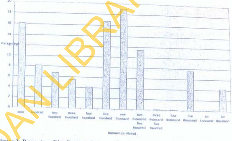
Figure 2: Percentage Distribution of Prospective Contributory Amounts to UTP

The MLE coefficients of the Tobit model used to investigate factors affecting the probability of contributing money to urban tree planting in Lagos metropolis and the prospective contributory amount are shown in Table 1 below.