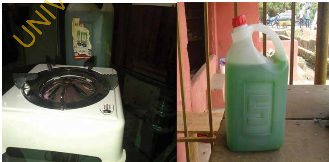
FIGURE 7 Biofuel cooking stove in Ibadan(left) and the extracted bio-crude(right) in Makurdi, Nigeria

and Canrex Biofuel Limited) are engaged in the refining of biodiesel for final consumption by GSM providers. The larger proportion of feedstock for biodiesel production in Nigeria comes from Jatropha curcas nut oil. It was estimated that a hectare of Jatropha plantation is able to yield between 0.5 and 12 tonnes of nuts per annum depending on the age of the plantation and management practices adopted, and if the right inputs such as booster fertilizers and hybrid seeds for plantation establishment are used. In addition, one metric tonne of Jatropha nuts yields up to 139 litres of crude biodiesel. On the average, 100 kg of Jatropha curcas nuts are produced per hectare in a year. Estimated yields of raw materials used in biofuels production as reported by the Nigerian National Petroleum Corporation (NNPC 2012) are given in Table 10. Current consumption of biodiesel in the study area is around five litres per month per household. Also, according to FAO et al. (2011) there are several emerging bioethanol projects in Nigeria based on sugar cane and cassava plantations. The