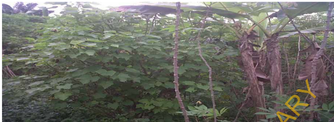
FIGURE 6 Jatropha intercropped with cassava and plantain, Eku, Delta State, Nigeria

was intercropped with cassava (Figure 6). Massive land areas are still available for production in the country. Over 4 000 ha of land has been projected for Jatropha in Nigeria.