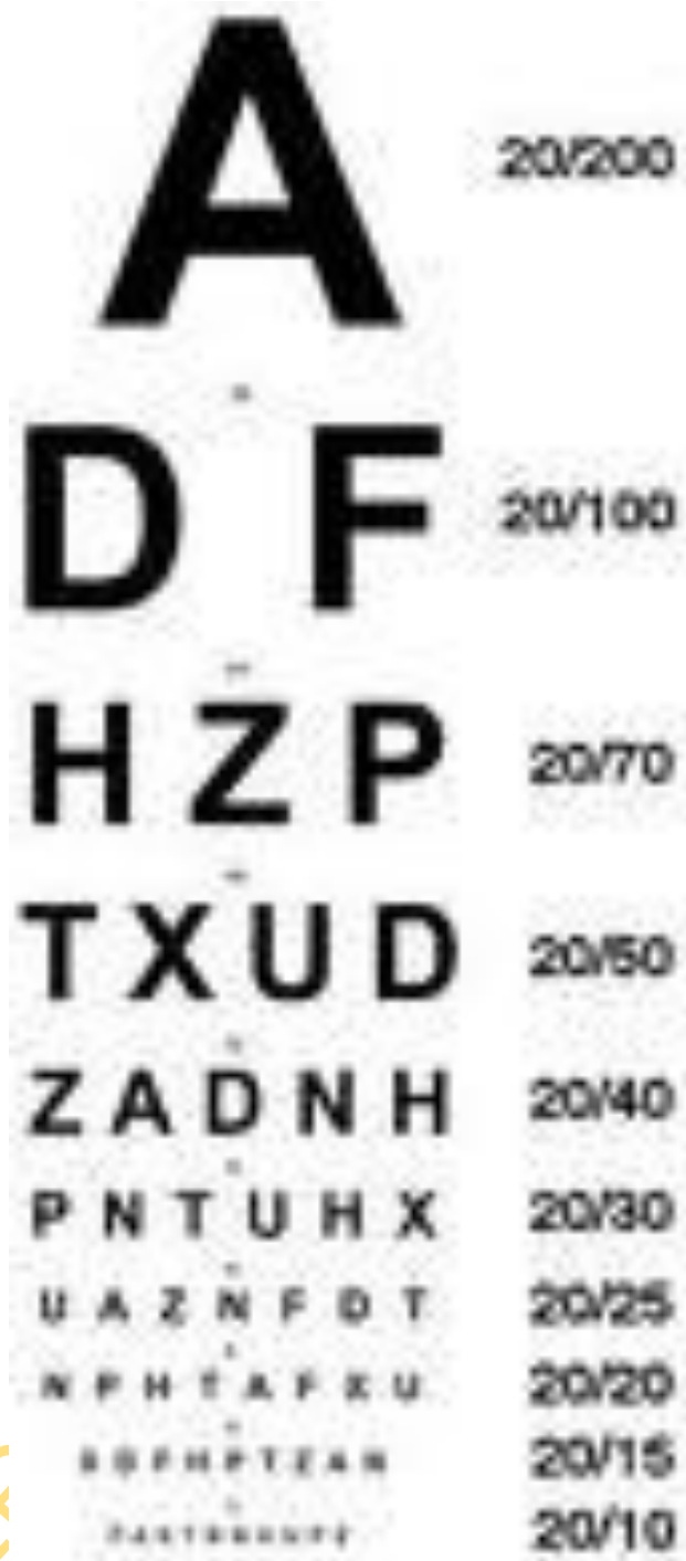
Fig. 3.1: Snellen Chart