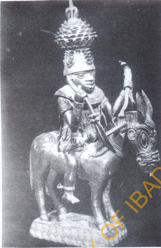
Plate 1: Benin Equestrian Figure, c. 1600 AD

thoroughly examined, and such figures are easily recognizable and less controversial and puzzling to decipher. While Luschan was obviously referring to a non-Benin personage as the equestrian, he excluded European visitors to Benin.