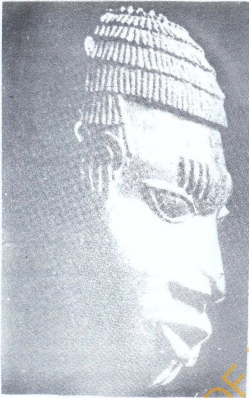
Plate 2: Ejube jailo, Benin type mask – a part of the regalia of the Atah of Igala