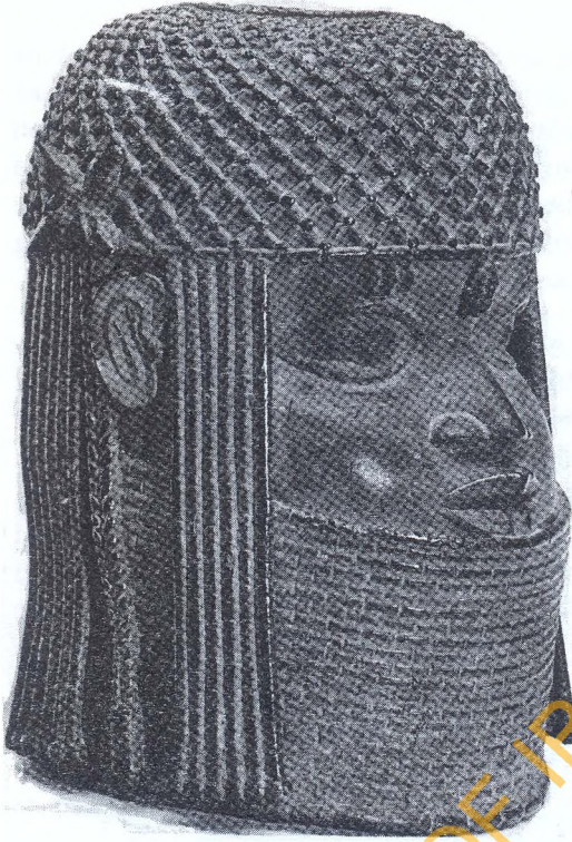
Plate 4: Benin bronze head in the Museum für Kunst und Gewerbe , Hamburg

in the Benin equestrian figure is meant to represent must be closely associated with the palace. This is more so as the equestrian figures are believed to have been used to adorn ancestral altars. Then of course their function has implications for their identity and meaning. I believe that they were put on altars as a constant reminder of an event in the history of Benin. Such an event must be sufficiently significant to attract the attention of the ancestors. It is therefore not to be expected that the rider would be someone with whom the Oba had never interacted, or indeed one with whom he had a superficial relationship. The fact that horse riders are also represented in plaques is a pointer to the significance of the subject. The plaques were custom made for the explicit dissemination of significant court events.