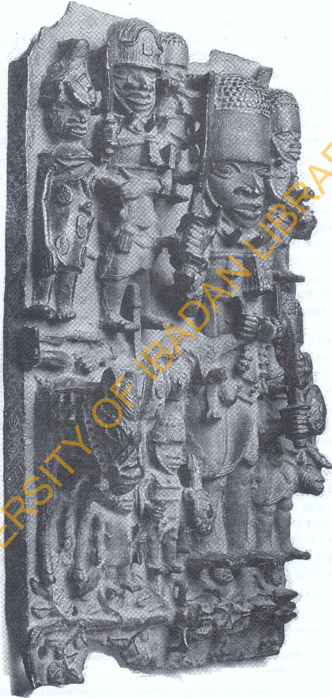
Plates 3a & 3b: Front (opposite) and side views of the Benin plaque in the Museum für Kunst und Gewerbe , Hamburg