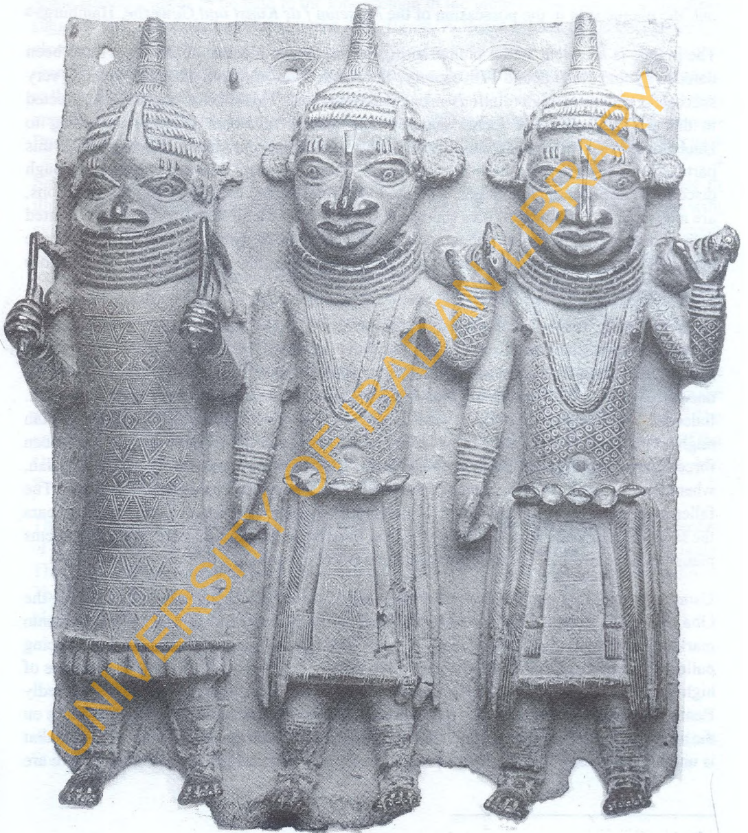
Plate 5: The other Benin plaque in the Museum für Kunst und Gewerbe , Hamburg