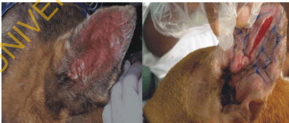
Fig. 2A: A dog treated with pillow compression method by the authors. Observe healing with ears erect without support.