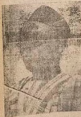
Oloye Obafemi Awolowo

Irokeke ti awon olopa na pelu awon faga won po pupu ju ti o fi je wipe ni-nu ogunlogu awon enia pataki pataki ti won wa lati ilu bi Abeokuta, Ibadan Ijobu-Ode, Shagamu, Ibaro, Ekiti Coutonou, Aja-se ati awon ilu bebe ti wa lati gbo oro ejo na ko raye wole, awon enja die ti awon olopa ga laye lati wole, g'ogbo awon ti awon wole na ni won ye akan ti o wa lara won wo kinnikinni awon ko si ri nkan jamba lowo on ke ni rata.