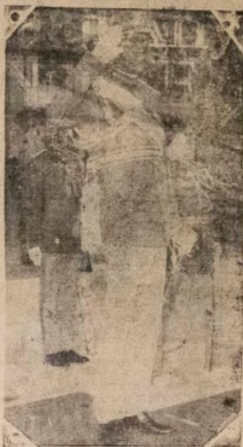
During the Opening Session of Federal Parliament in Lagos, the President Dr. Nnamdi Azikiwe inspected a guard of honour, in front of the house.

LONDON... A big rise in British investment over-