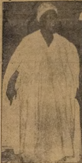
Alhaji Aderiran Adeyemi

Enyin okawe wa yio ranti wipe Oba Alafin, Alhaji Aderiran Adeyemi Keji yi ni ijoba Iwo-orun mu lo si Ilesha lasiko rogbo yan ija