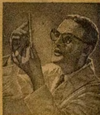
Sodium N-Lauroyl Sarcosinate SAME FAMILIAR PACKAGE

Lilo ti ope enia nlo egbogbi yi fihan wipa egbogbi yi ko njeki ehin enia baje pelu egbogbi Gardol. Awon Alase Isegun ehin ti se ayewo re fun odun kan pe egbogbi na ko nkuro heni ki nsa. Bi o ba sa ti nlo ni ojojumo, laro ati ni ale, ko ni jeki ehin baje t'osan t'oru.