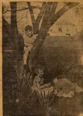
Aworaa om'ba Charles tin Gaidi a my'eechi o'ba P'ola ni a n'we si o gun lgi ti aburo re obirin n'we n'isi idi lgi na yi, abun agbala igbadun egbe ile o'ba.