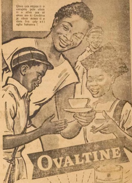
O nfun awon emede awon omogun pelu ilera

Ebun oja atejese ti o oarajulo pelu ohun ti o nfun ara ni okun mu ki Ovaltine je ohun mimu ti o dara fun odo ati agba bakanna!