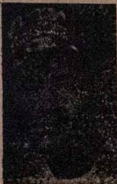
Alhaji DIPCHARIMA Federal Minister of Commerce and Industry.

Meanwhile, all the trade deals with other conventional countries are holding turnover of several million pounds annually. It is understood that Soviet Union may be larger considering the size of the country.