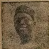
OLOYE OBAFEMI AWOLOWO

Aworan iwe wa ose yi niti eni-Ola Oloye Obafemi Awolowo, o kan pataki ninu ojogbon ile Nigeria, ti ise alakoso Ijoba Iwo-orun (Premier, Western Government) ti o le silu Qyo ninu ose yi,