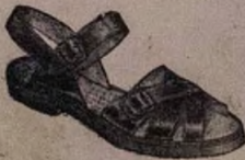
Style 42 27/6