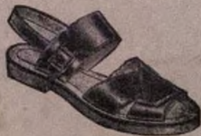
Style 43 32/6