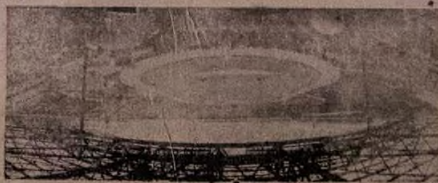
Eleyi ni aworan papa ile-ere tuntun ti nwon se pari ni ilu London, o si gba to oke enia awon aworan lati joko ni ibe.