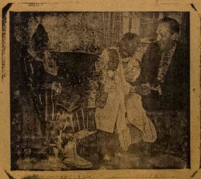
Eniti a owo ni owo osi yi ni Emir tabi Oba Kano, Sa'usai ninu owo Alari re. Legbe re ni owo re kalara ti o mu lo si Meis ati obotaja omo na. Oyinbo ti o jake loya eke ti o agba owo loya omo eke Kano ni Alagba Sir Alan Lennox-Boyd.