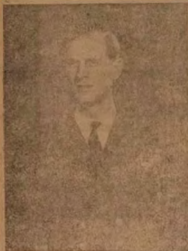
DUKE OF EDINBURGH

Oloye ti Edinburgh je eniti o ni ife fun agbami, nigbati o bere oko re ni Scotland, gbara ti o si fi ile-eko silẹ bi ogun-odun aghin, o di eniti o nkeko ni ile-eko awon omo ogun ti o wa l'agbami okun Geggbi itan, gbagbo awon idile re ni o feras iru igbe bayi, baba re papa si je oloye agba ri ninu oko ogun oju omi ti ile Gesi.