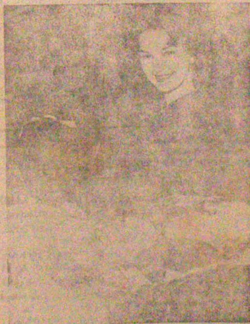
Omode kekere, omo odun mejo ti a nwo ninu

Awon ti a nwo ninu aworan yi ni ogbeni Herbert Morrison nigbati o lo si ile eko giga kan nibiti a o gbe ma ko awon akeko ni ogbon ori ati ogbon inu Ile eko na si gha to egbaa omo akeko, tokunrin tobinrin lo si nkewe nibe, iye owo ti nwon fi pari ilowe na, ati awon ohun elo inu re je £671,000.