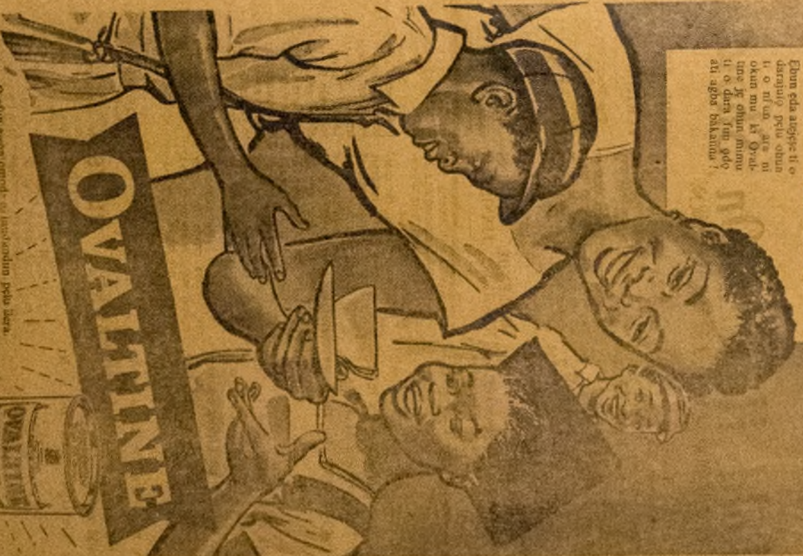
O niun awon omotodi o loodi aradun pelu hera.

Edun eda aragbe ti o daraunio pelu okun- ti o ni la ara ni okun mu ki Orat- tue jg okun munu ti o dara fun gdo aai agba bakanna ?