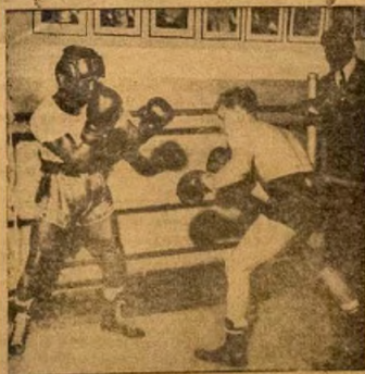
Larapa ija idanraro ti Ogbeni Davey Moore ba Hogan "Kid" Bassey ja ninu eyiti uwon ni lati da ija na doro nitokope Bassey ti ara sepe. Ija na ni awon ngbero lati tunja niu Los