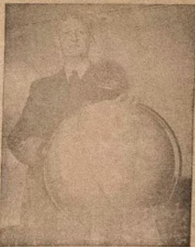
Admiral Sir David Luce, Britain's new First Sea Lord, picture in his Office at the Admiralty in London shortly after taking up his appointment.

Sir David entered the Royal Navy in the submarine service in 1927. After a distinguished career, he was appointed Commander-in-Chief, Far East Station in 1960, the highest British Command position in the Far East in 1962, holding this post until his present appointment.