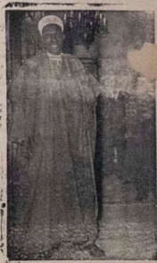
Ijoba fisan wa wipe abay'ri ajoro awon igbimo Ijoba ni enia dudu ti nwan re si Monrovia ni o'figha ni. Ati agbege re ti je iduro fun awon ije enia dudu ti o'figha Faranse ni awon awon ilu bi Dahomey, Niger ati Cote d'Ivoire.

EKO--Ibade ti o jade nla Eko ni awon oju Alamisi oju yi ni wipe Ijoba Apapose ti sekun ile Nigeria ti o ti mo Ijoba Faranse lati oju January to kọja larin eto doro ti awon idanwo nle yarin Sabara.