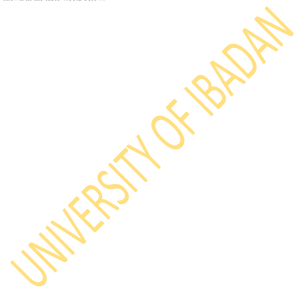
Table 4.10.2 reveals reasons stated for answers picked under emotional trauma as identified by teachers which included that students may develop feelings of inadequacy when comparing self to others (mates) students 42 (12.2%), that students seeing punishment as a means of disgrace 49 (14.2%), that emotional trauma cannot be applicable or linked to CP 45 (13.1%). Others are as shown in the table 4.10.2 below.