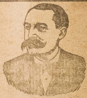
Trade Mark Registered