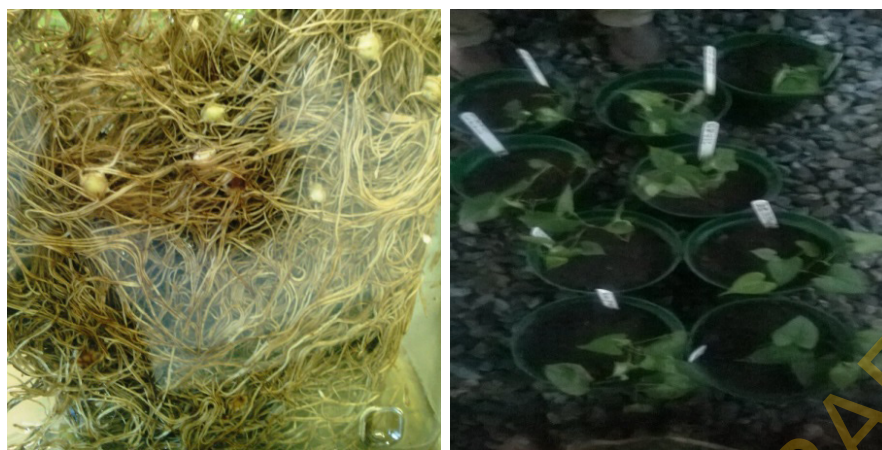
Figure 3. In vitro microtubers weighing 0.3–2.7 g (left) planted and sprouted (right)

containing 30g/l sucrose, 100 mg/l myo-inositol, 20 mg/l L-cysteine, 80 mg/l adenine hemisulphate, 0.2/l mg benzylaminopurine and 1 mg/l uniconazole-P. Plantlets were regenerated from the meristem for 16 weeks and transferred into yam multiplication medium described above for further growth, which took sixteen weeks. Leaf samples from the heat-treated meristems which regenerated into plantlets and those of the virus-positive controls were tested for viruses using PCR. The incidence of infected plants recovered from each virus or mixed infection was recorded and compared with descriptive statistics (%) using SAS (Version 9.4 (TS1M2) 2012).