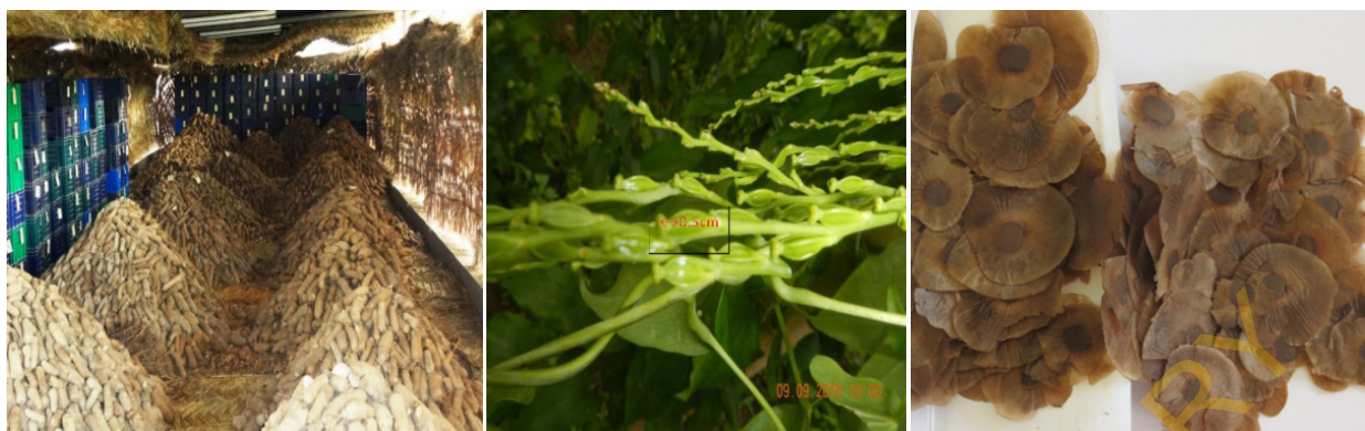
Figure 1. Seed tubers of yam (left); female flowers bearing fruits (middle); zygotic seeds from fruits (right)

in yam fields in single and mixed infections (OP-PONG et al. 2007; ENI et al. 2010; ASALA et al. 2012; ODEDARA et al. 2012). Poty-, potex-, badna- and cucumo-viruses have been reported in Dioscorea spp., but the most significant loss is caused by Yam mosaic virus (YMV) (MALAURIE et al. 1998). Diseases accumulate over generations of the use of unhealthy seed tubers with threat of the extinction of valuable germplasm. Therefore, there is scarcity of virus-free seed yam. Up to 63% of the cost of production is spent on the purchase of seed (IRONKWE et al. 2007). This makes it necessary to improve the existing informal seed production and development of a formal yam seed system where regulatory rules are functional (BALOGUN et al. 2014).