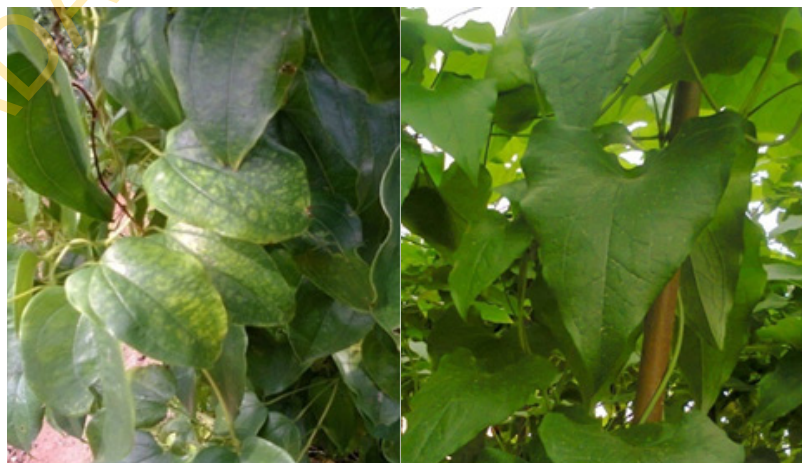
Figure 2. Symptomatic (left) and asymptomatic (right) yam plants

Another experiment was conducted to determine the effect of heat therapy on the virus status. Meristem-derived plantlets of improved genotypes of water yam (TDA 95/01166) and white yam (TDr 95/05575, TDr 95/19158, TDr 95/19177, TDr 95/18544, TDr 89/0070, TDr 89/02677, TDr 89/02565) were tested for YMV, YMMV, CMV and BV using PCR. Two-node cuttings from the virus-positive plantlets were sub-cultured onto the same multiplication medium and incubation conditions as described above for one week followed by transfer to a growth cabinet set at 36 \pm 0.5^\circ\text{C} and 16 h photoperiod for twenty-one days. Newly initiated meristems about 0.5–1.0 mm long were excised with the aid of a dissecting microscope and cultured on modified MS medium