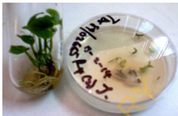
Figure 5. Uncontaminated yam plantlet (left) tested positive for bacterial endophytes in bacteria indexing medium (right)

The numbers of single node vines cut from five stands of Hembakwase were 34, 13, 8, 4, 50; from one stand of Pepa it was 23 while it was 7 from one stand of Amula. Based on the virus-negative result of the five positively selected stands, additional single nodes, not meristems, were cut from the stands for in vitro introduction in order to remove endophyte-contaminated stocks through bacteria indexing, with an average of 121.3 \pm 59.3 vines per plant. Vine cuttings from positively selected plants (Figure 4) increased the rapidity of virus-free stock generation by a factor of 121, and could be more, depending on