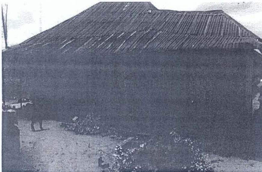
Figure 2: Dilapidated building used as ward for TOP Patients

The perceived benevolent posture of practitioners was also observed to have reflected in their attitude and ways of relating with patients. Practitioners often cracked jokes with patients and sometimes relaxed with them in the evenings. This contributed to the restoration of patients' health which according to WHO is not merely the absence of disease or infirmities. Although practitioners could not afford to build wards for patients as obtained in western hospital settings, they offered them free accommodation to all in-patients even if it meant begging members of their community to accommodate patients as a humanitarian gesture. However, such accommodation was mostly located in dilapidated or uncompleted buildings such as presented in Fig-2 and Fig-3 below.