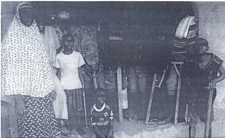
Figure 2: Uncompleted building used as ward for TOP's patients

According to practitioners, most simple fractures healed in less than four months possibly due to non-use of plaster of paris (POP). It was therefore easy to constantly assess the healing process as well as massage the injury as the case may be from time to time. This probably accounted for the 15.3% of patients who preferred TOP due to faster healing associated with its treatment. This was attributed to the use of wooden splints by practitioners to provide necessary support/guard that facilitated healing within a couple of weeks; unlike the modern POP which does not allow for ventilation and yet takes several months before the cast is removed. The fact that TOP are located in the communities and allowed for home-service promoted access to care and accounted for the 14.1% of patients who identified nearness as their reason for preferring TOP.