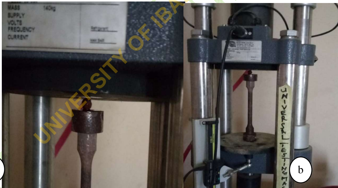
Figure 3a and 3b: Lophira alata seed under loading using a UTM (Techquipment SN1000)

The crushing force of Lophira alata was determined using a Universal Test Machine (Techquipment SN1000). This was determined following American Society for Testing and Materials standards (ASTM, 2008). The seeds were ultrasonically treated in a water bath at room temperature ( 28 \pm 2^\circ\text{C} ) for 60, 120, 180, 240 and 300s. This was also repeated without ultrasonic treatment for the same period. Figures 3a and 3b show Lophira alata seed under loading.