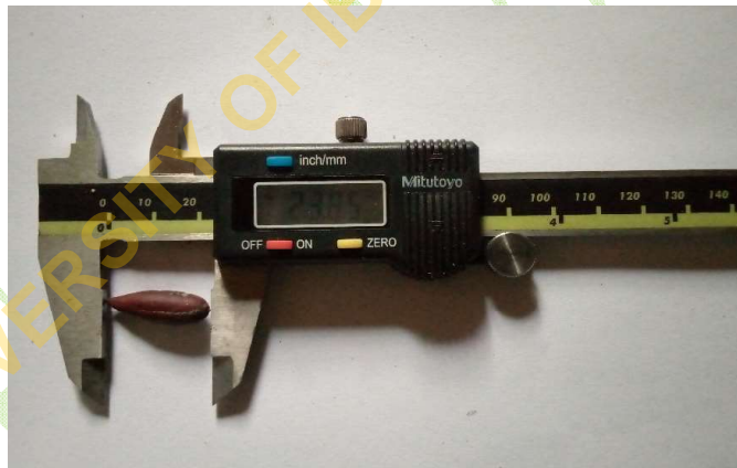
Figure 1: Measurement of dimension of Lophira alata seeds using a vernier caliper