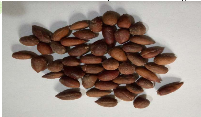
Figure 2: Lophira alata seeds