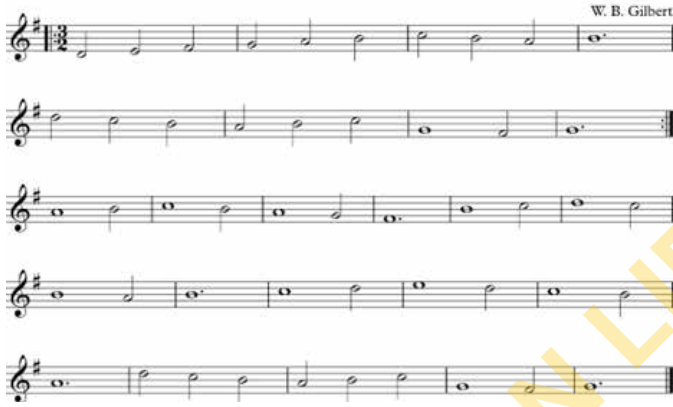
Figure 5: Musical notation of the song Àwon àfin rẹ l'ẹwà (Pleasant are thy courts above)

Àwon àfin rẹ l'ẹwà N'ilẹ 'mólẹ àt'ifẹ Àwon àfin rẹ l'ẹwà L'áyé ẹşẹ àt'òşì Ẹmí mí tí ñ pòngbẹ tó Fún ìdàpò ènià rẹ Fún ìmólẹ ojú rẹ F'ór '-ofẹ rẹ, Ọlórún