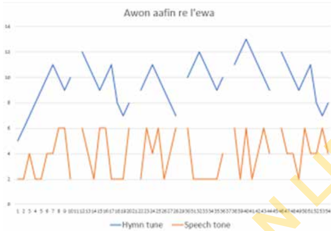
Figure 6: Graphical illustration of the song Àwọn àfín rẹ̀ l'èwà (Pleasant are thy courts above)