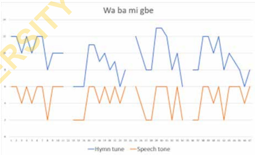
Figure 16: Graphical illustration of the song Wá bá mi gbé (Abide with me)