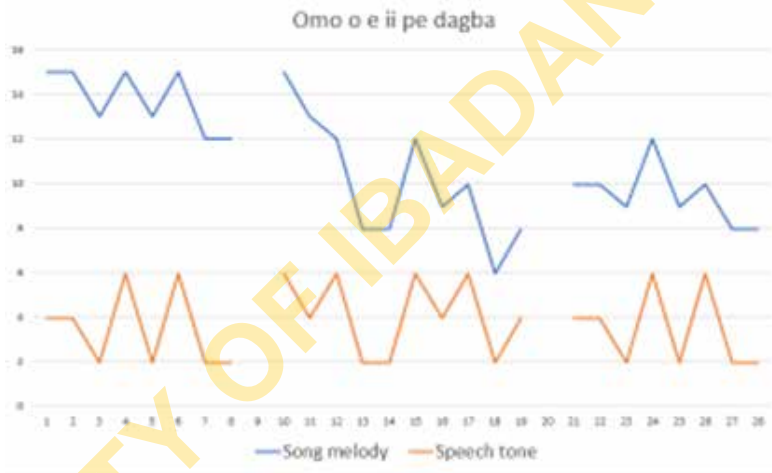
Figure 2: Graphical illustration of the song Ọmọ o, é ń pé dàgbà (Children grow up in no time)

The graphical illustration below shows the correlation between the melodic and speech-tone contour of the song, which implies that the song effectively communicates the intended meaning of the words.