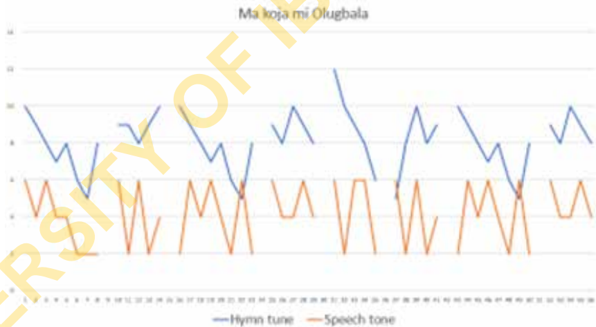
Figure 14: Graphical illustration of the correlation between hymn melody and speech tone of the song Ma kojá mi Olùgbàlà (Pass me not, O gentle savior)

Presented below is the inappropriately translated European version of the hymn as sung to the European hymn tune ‘Pass me not’?