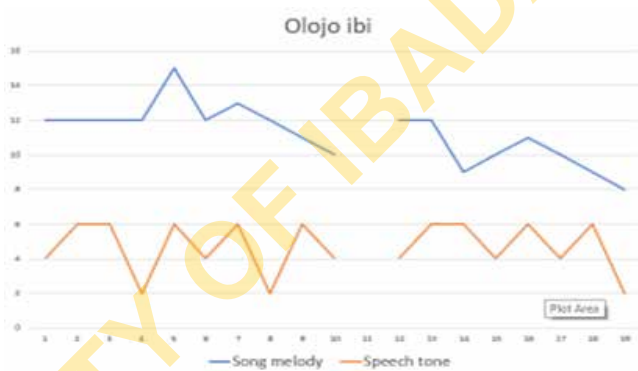
Figure 4: Graphical illustration of the song Olojó ibí (The birthday celebrant)

Below is the illustration of the lack of correlation between the song melody and speech tone. The last phrase of the texts of the song when sung to the tune above, could be perceived as 'display madness and do it quickly.'