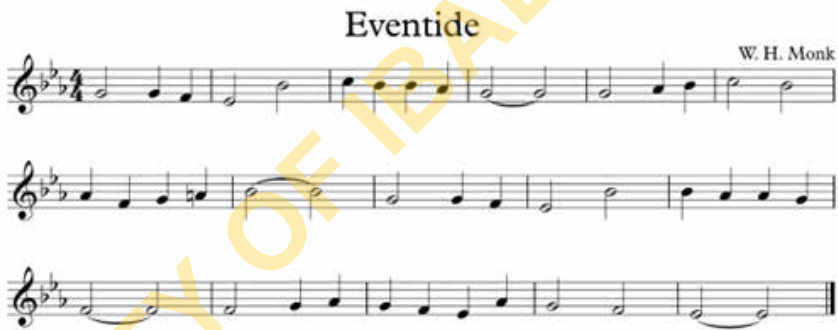
Figure 7: Musical notation of the song Wá bá mi gbé (Abide with me)

Wá bá mi gbé, alẹ̀ fẹ̀rẹ̀ lẹ̀ tán Òkùnkùn sù, Olúwa bá mi gbé Bí olùrànlọ́wọ̀ m̀ìràn bá yẹ Ìrànwọ̀ aláìní, wá bá mi gbé