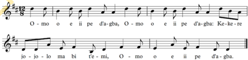
Figure 1: Musical notation of the song Omọ o, é ń pé dàgbà (Children grow up in no time)

To effectively communicate through song using the Yoruba language as medium of expression, there is need to align the melodic contour with the rising and falling of the intonation of the Yoruba words used as lyrics. This principle, Vidal (1986) referred to as ‘logogenic.’ The European missionaries that translated English hymns to Yoruba were not aware of the logogenic principle and did not apply it as one of the important dimensions in the translation of hymns to tonal languages such as Yoruba. This is demonstrated in the song “ omọ o é ń pé dàgbà ” as given below.