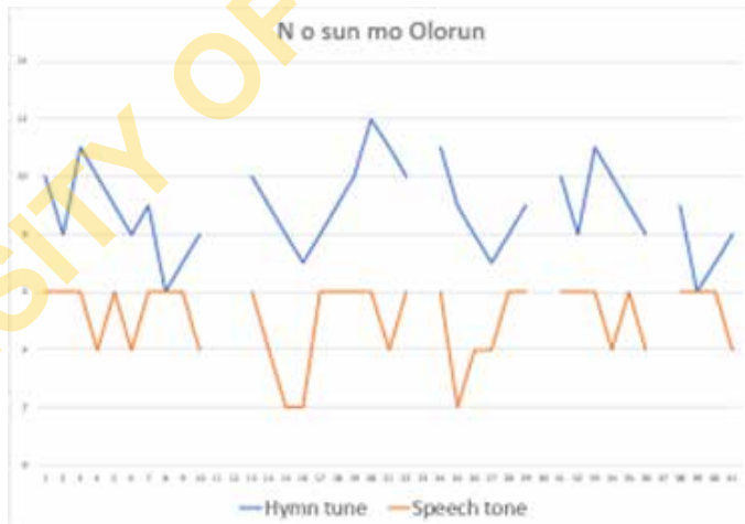
Figure 11: Graphical illustration of the correlation between hymn melody and speech tone of the song N ò sun mo Olorun (Nearer, my God, to thee when sung to the tune of ‘St Bede’)

The graphical illustration of the correlation between hymn melody and speech tone in the inappropriately translated version of the same hymn when sung to the European tune ‘St Bede’ is shown below.