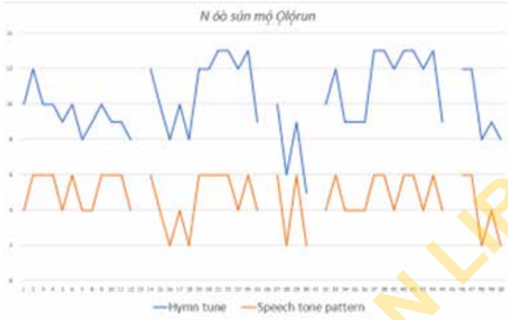
Figure 10: Graphical illustration of the correlation between hymn melody and speech tone of the song N òò sùn mò Ọlórún (Nearer, my God, to thee)

The graphical illustration of the correlation between hymn melody and speech tone in the inappropriately translated version of the same hymn when sung to the European tune ‘St Bede’ is shown below.