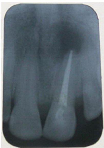
Fig 5: Three (3) months post-periradicular curettage

radiographic terminus (Fig. 3). The root canal system was obturated by lateral compaction of gutta-percha coated with a calcium hydroxide based sealer (Sealapex-Sybron/Keer USA) and access cavity restored with zinc phosphate cement (Fig. 4).