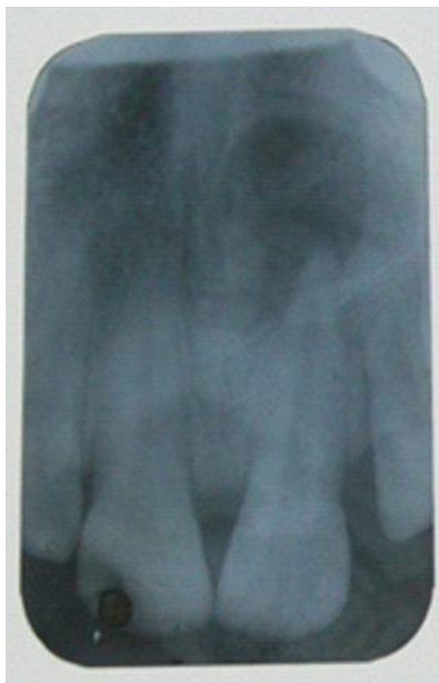
Fig 1: Pre-op periapical X-ray view

placed in the root canal at full length without encountering any resistance, radiograph taken revealed that the file was short of the radiographic terminus by 4mm. Therefore, a size 31mm ISO size 25 Kfile was then placed in the root canal at 29mm using digital tactile sensation and the repeated working length radiograph showed that the file was at the radiographic