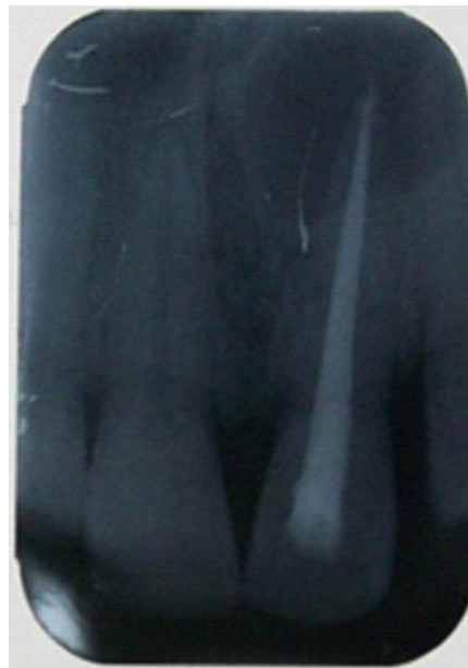
Fig 4: Immediate post-obturation

was dried with paper points and a non-setting calcium hydroxide (Rite Dent Corp. FL, USA ) dressing was placed within the canal and access cavity restored temporary with zinc phosphate cement (Prime Dental Manufacturing Inc., Chicago, Illinois). The Patient was