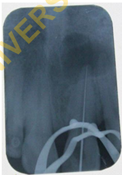
Fig 2: Working length determination

terminus (Fig. 2). Biomechanical preparation of the root canal was carried out with serial K files ranging from ISO size 25 to ISO size 50 (Premier Dental Products Co, Canada, PA.), using step back technique under continuous irrigation with 2.5% sodium hypochlorite solution (Reckitt Benckiser Ltd, Agbara, Nigeria). When preparation was completed, the canal