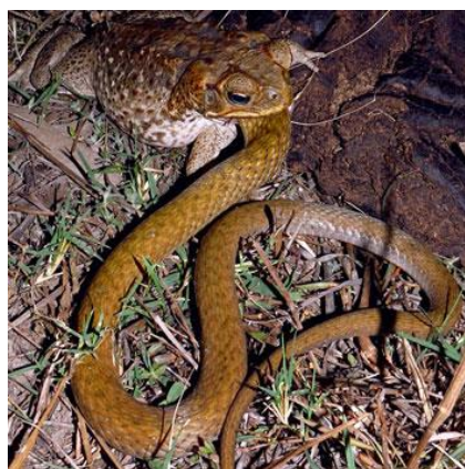
Figure 2: Alien vs predator ... the cane toad, an introduced pest, eating its predator the Keel back snake. Alien vs predator as cane toad eats keelback snake ( Tropidonophis mairii ) Cane toad has taken revenge on the only snake that can eat them and survive. The Keelback snake is a known predator of the introduced pest, but as this amazing photo shows the tables have been turned. The Keelback is a freshwater snake and is the only snake known in Australia that can eat cane toads and survive.