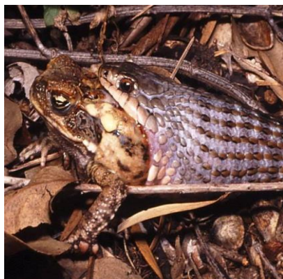
Figure 1: Keelback snake ( Tropidonophis mairii ) eating a toad. They are the only species of snakes that can eat a toad and survive [Source: Wilson, 2008].