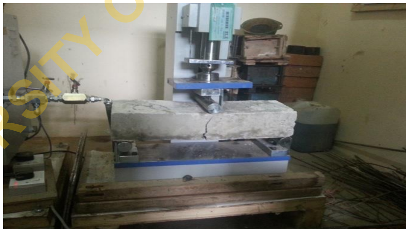
Figure 3. Flexural test on beam in progress.