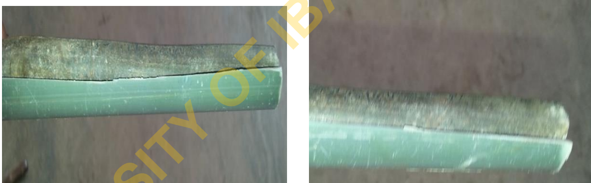
Figure 1. 50% and 25% debonded steel bars.

The simulation of the falling off of the concrete cover was done by restriction of the formation of the bond between the bottom steel section and the surrounding concrete. The provision of Polyvinyl chloride (PVC) pipes along the entire length of the bar was sufficient in preventing the interaction between the steel and the concrete and possible stress transfer. Adjusting the perimeter of the PVC pipes was done to vary the degree of spalling. The PVC pipes used were sawn in such a way they encased 25% and 50% of the bars perimeter to simulate the pop off and de-lamination effect of spalling respectively.