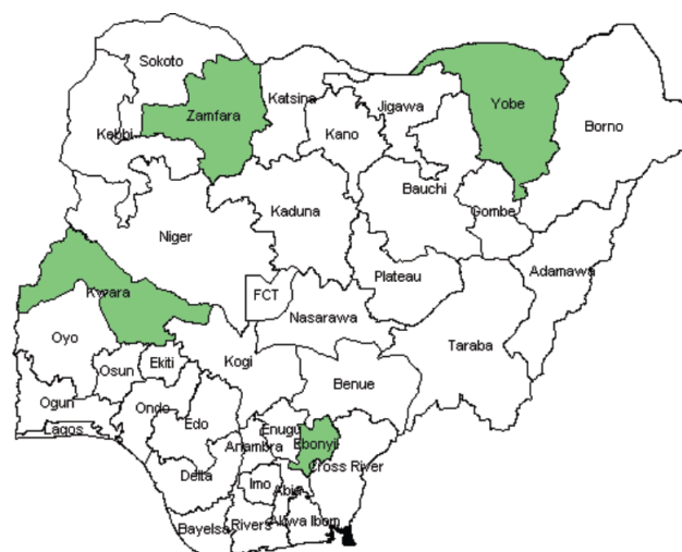
Figure 3. ITN coverage in Nigeria (states shown in green have met the RBM target of 80% coverage).

The use of ITN and IPTp are two of the most effective measures in reducing the risk of malaria among pregnant women. This study showed a high level of ITN use but a low level of IPTp uptake. This high rate of ITN use may not be surprising, given that bednets have been provided for free, although women may also purchase them or get them from other sources. However, this high ITN utilisation contradicts the findings of a previous study in which low ITN use was reported among pregnant women attending private and public clinics in Lagos State [10]. In addition, previous studies in Nigeria have documented low