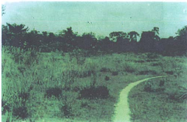
Plate 1: A farm Fallow Vegetation.

The vegetation of the forest reserve could be categorized into farm fallows (Plate 1), relics of the natural lowland rainforest, Raphia bush, Mangrove vegetation, Oil palm bush and relics of Gmelina plantation. The structure of the vegetation could be categorized on the basis of the various vegetation types as follows: