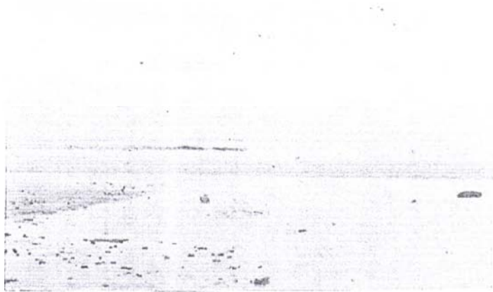
Plate 8: A sandy beach at the Mobil unlimited headquarters.

The presence of white sandy beaches (Plate 8) and in fact luxuriant natural vegetation in several places around the forest reserve is a great potential for ecotourism activities.