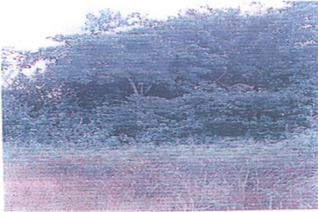
Plate 2: Relics of Lowland Rainforest at the boundary of the Sanctuary.

Elaeis guineensis and Mangifera indica at various points within the forest reserve. This vegetation exhibits the characteristic of maturing secondary forest with broken canopies and the presence of species such as Ceiba pentandra ; Bombax spp. ; Alchornea cordifolia ; Senagilnalea spp. ; Calamus spp. ; Rauvolfia vomitoria ; Herlia ciliata ; and Tabernamontana pachysiphon (Plate 2).