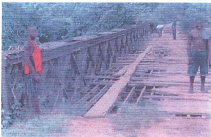
Plate 6: Dilapidated bridge linking the conservation area with Uyehe Community

Accessibility to the area via road is generally poor as most of the access roads are only seasonally motorable. Plate 6 shows a typical access bridge in the study area. In addition, communication facilities in the area are poor.