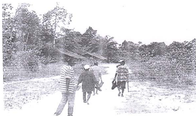
Plate 7: A settlement located within the sanctuary at Ntak- Iyang.