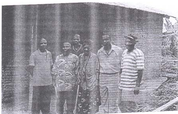
Plate 5: The chief of Mbo community with Forest Officers and Lifelink Consultant after a Focus Group Discussion.

project manager. The community had a population of about 500 indigenes as at 1992