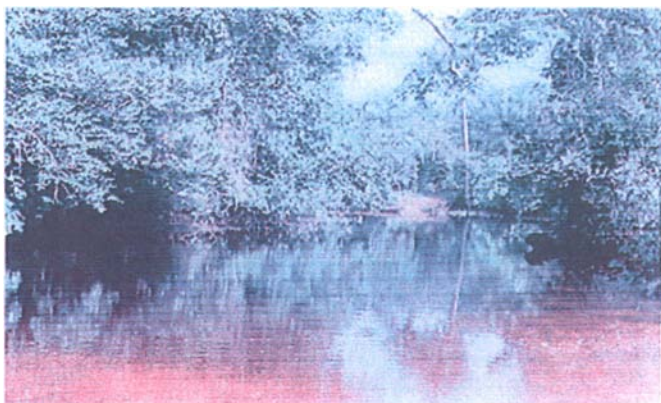
Plate 3: Characteristic mangrove vegetation along the coasts and creeks.

The dominant species in the mangrove vegetation include Rhizophora racemosa ; Rhizophora mangle ; Alchornea spp ; Avicinia avicinia and Phonix reclinata (Plate 3).