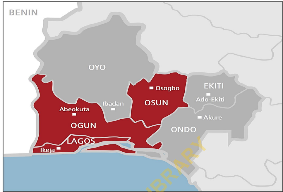
Fig. 1 Map of South-West Nigeria showing the study areas; Ogun and Oyo states.