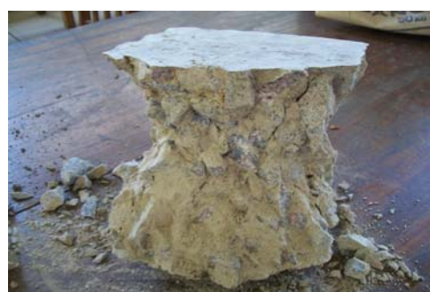
(a) Fractured experimental specimen