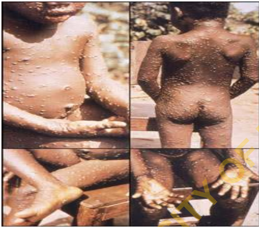
Figure 1: A child affected by monkeypox, showing generalized vesiculo-pustular rashes involving the trunk, limbs, face and limbs, extending to the palms and soles of the feet.

and generally less severe disease (4,16). Conditions which suppress cell-mediated immunity such as HIV may alter the natural history of the disease and may result in more severe infections (15). The lesions seen in them are also noticed to have regional monomorphism and a centrifugal distribution. Lesions in children may appear as nonspecific 1-5 mm erythematous papules, resembling an arthropod bite reaction. Mortality rates range from 1 to 10% with most cases occurring in children and in unvaccinated persons (16). Indirect or low-level exposure may result in asymptomatic or subclinical infections especially in persons living in or beside forests. Complications of monkeypox infection include pitted scars, deforming scars, secondary bacterial infection, keratitis, corneal ulceration, blindness, bronchopneumonia, septicaemia and encephalitis (3,5,17).