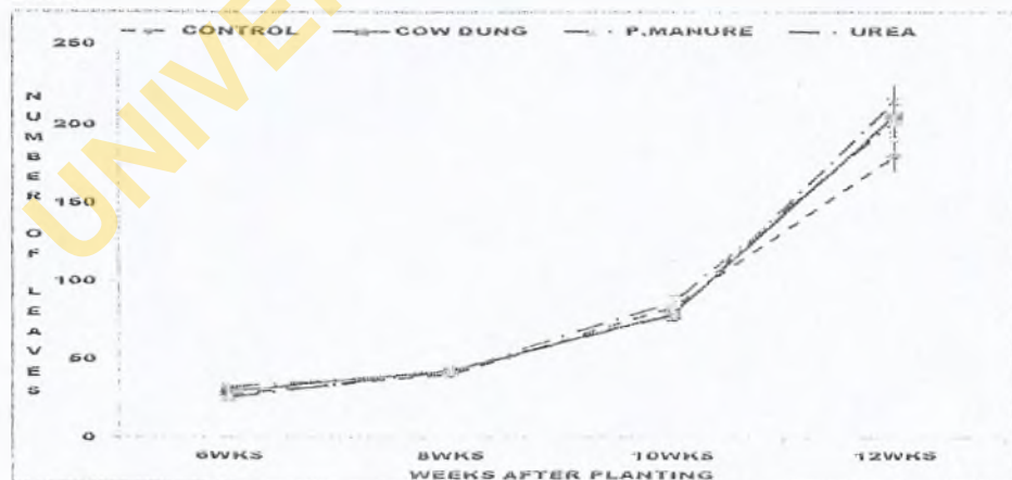
Fig. 2: Response of number of Leaf of Launaea taraxacifolia to soil amendments in Ibadan in 2015